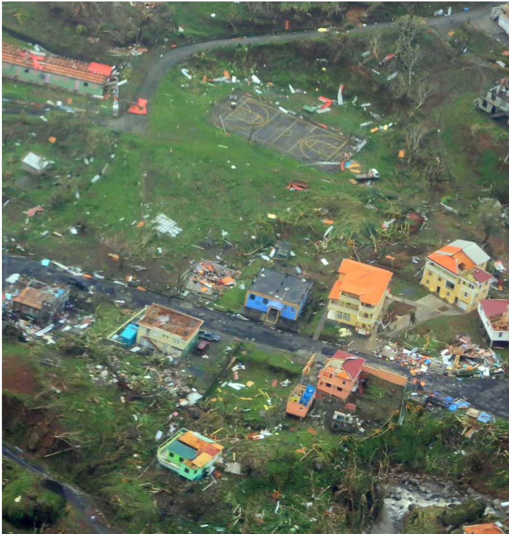
Dominica: Post-Hurricane Maria 2017