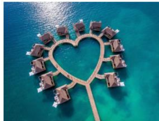
The 12 overwater bungalows at Sandals South Coast are arranged in a heart shape and connected to the beach by a wooden pier.

For a water baby like me, the chance to stay in an overwater bungalow was enticing.